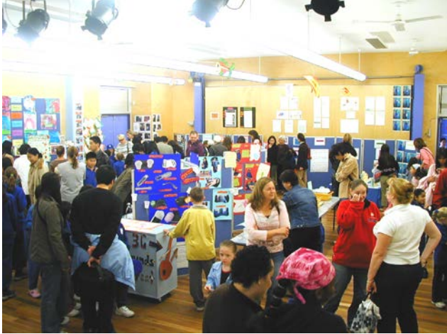
Parents attending the school's Science Expo

A wide range of other opportunities is also provided for students to demonstrate academic excellence. Students compete in the NSW Multicultural Public Speaking Competition, Premier's Reading Challenge and Premier's Spelling Competition. We also have a strong affiliation with the Powerhouse Museum where opportunities exist for selected students to engage in problem solving and enrichment activities.